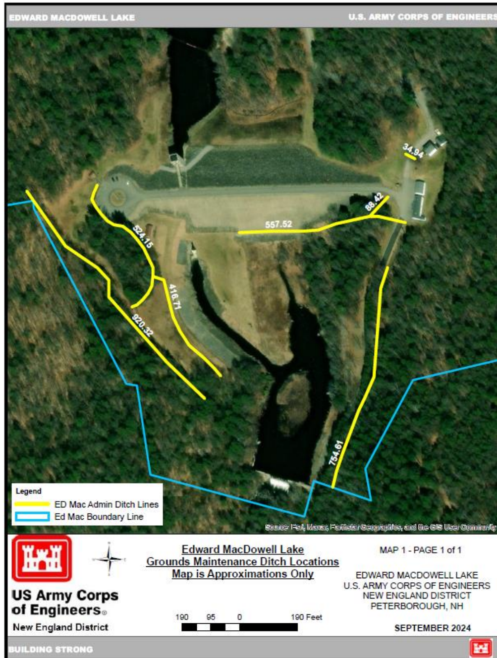
Informational Map 2